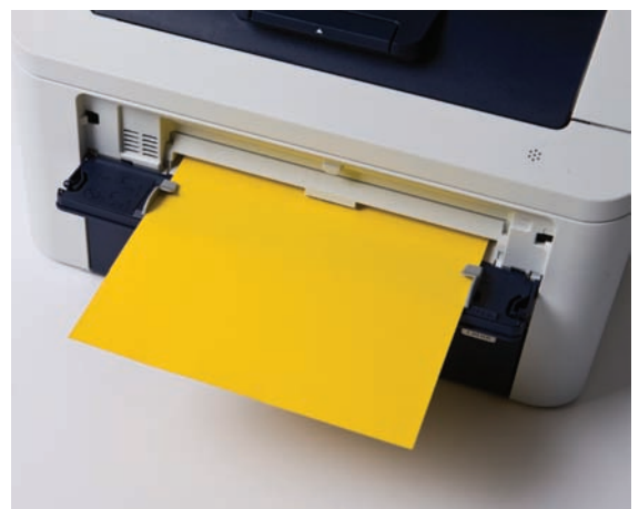
Print on thick paper or envelopes.