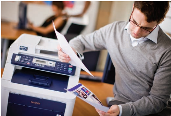
Create an instant impact - with up to 16ppm colour A4 printing.